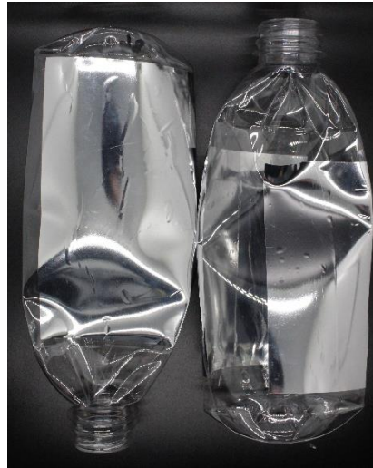
Bottle B6 and B10